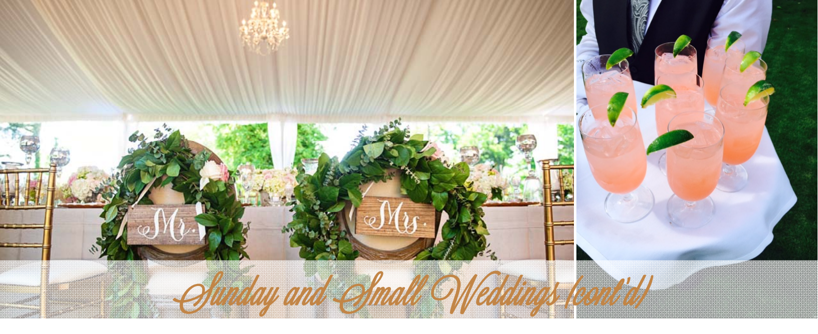
Available on any Sunday and select Saturdays when booking within 90 days.