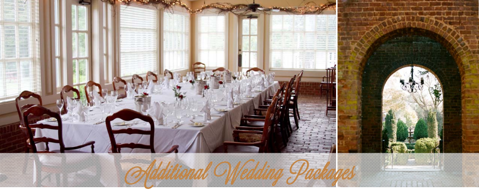
Ideal for rehearsal dinners or welcome receptions.