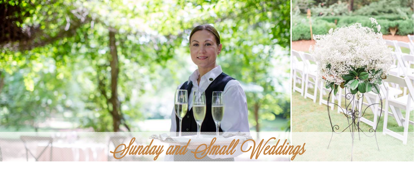
Available on any Sunday and select Saturdays when booking within 90 days.