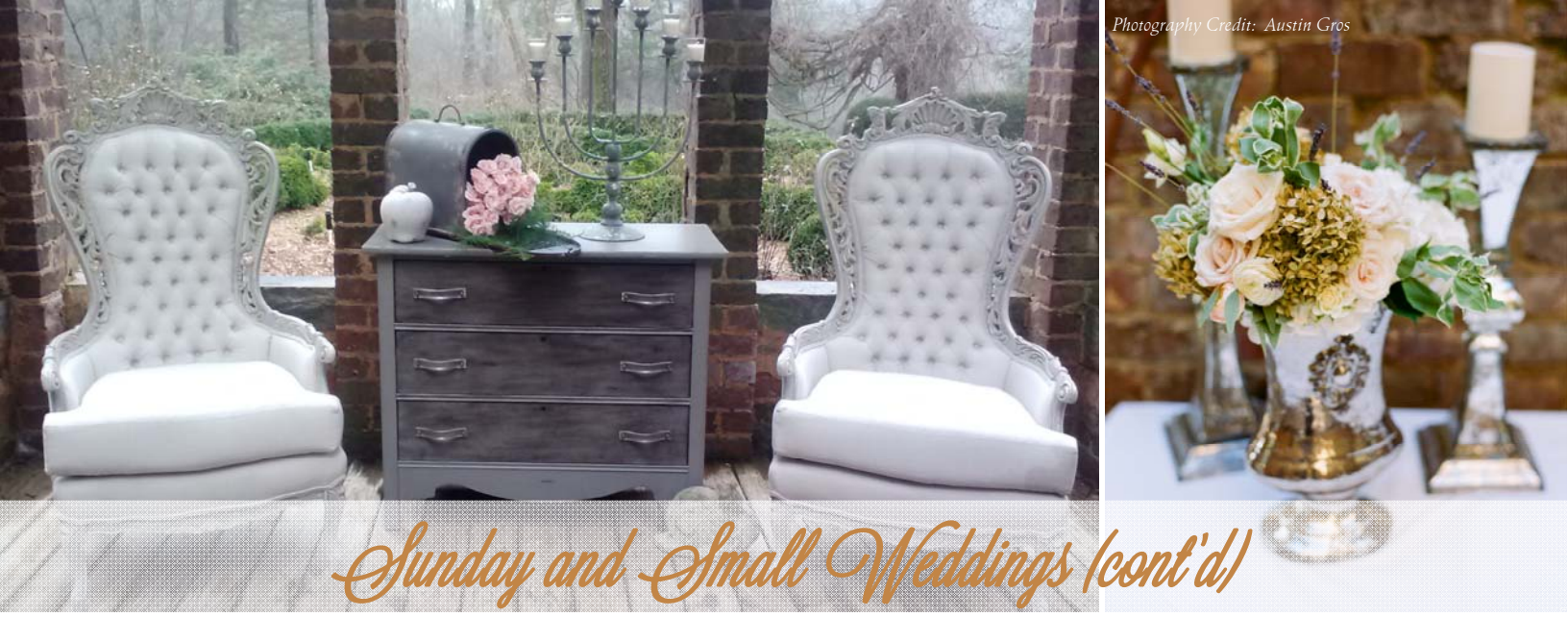
Available on any Sunday and select Saturdays when booking within 90 days.