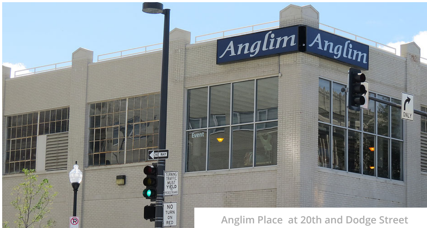
Anglim Place at 20th and Dodge Street

Featuring Brandeis Catering, Omaha's Premier Caterer "Impeccable | Delectable | Memorable"